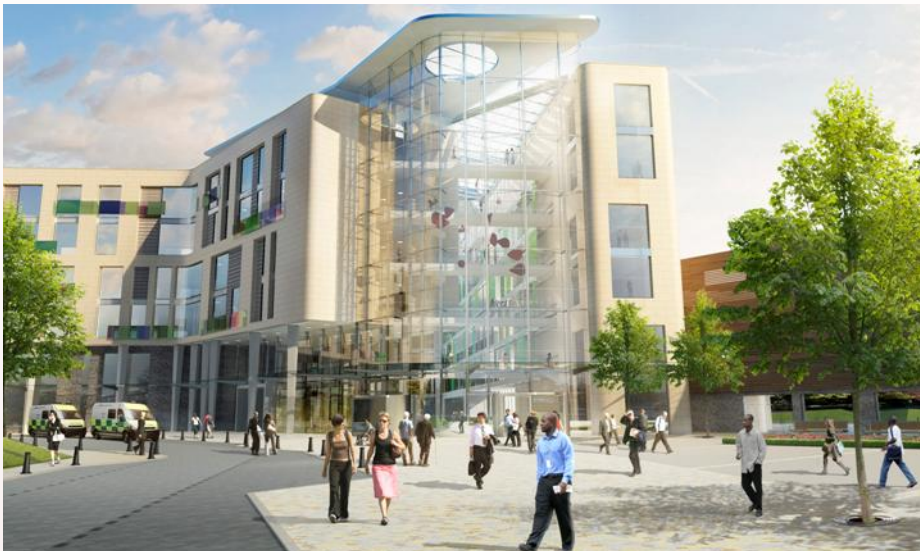
Artist's impression of the proposed super hospital

We were delighted in March 2009 to hear that North Bristol NHS Trust had selected our client, Carillion, as the front runner to design and build a new £430m super hospital at Southmead as part of the Trust's major comprehensive redevelopment of the site. Work on the preparation of a reserved matters planning application commenced immediately and, for a scheme of its size, was submitted in double quick time in July.