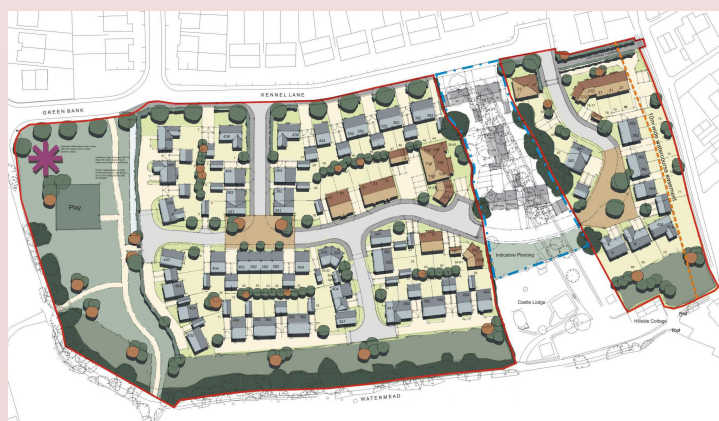
Illustrative masterplan courtesy of Pegasus.

KTC was responsible for the preparation of a Transport Assessment and Travel Plan while CSJ Planning was responsible for town planning and Pegasus Planning Group was responsible for the layout and landscape.